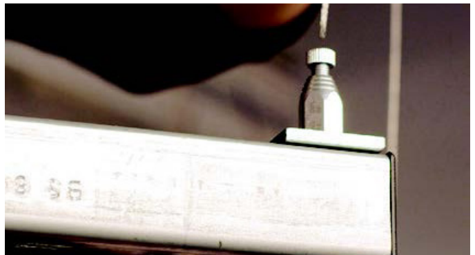
insert wire rope