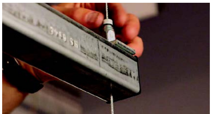
tighten collar to lock